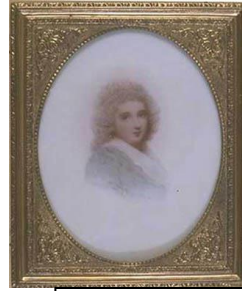
Abigail Adams Smith