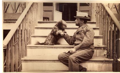
Henry Brooks Adams