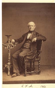
Charles Francis Adams