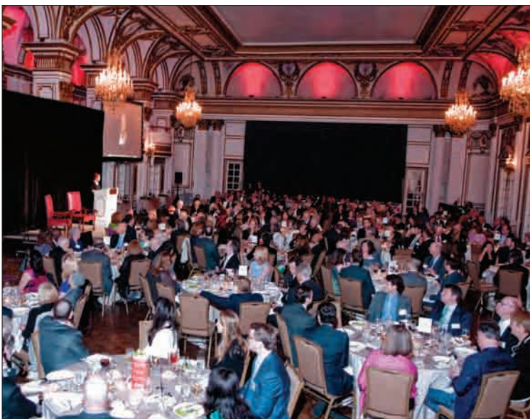
The Fairmont Copley Plaza in Boston was the scene of the Society's eighth annual Cocktails with Clio.