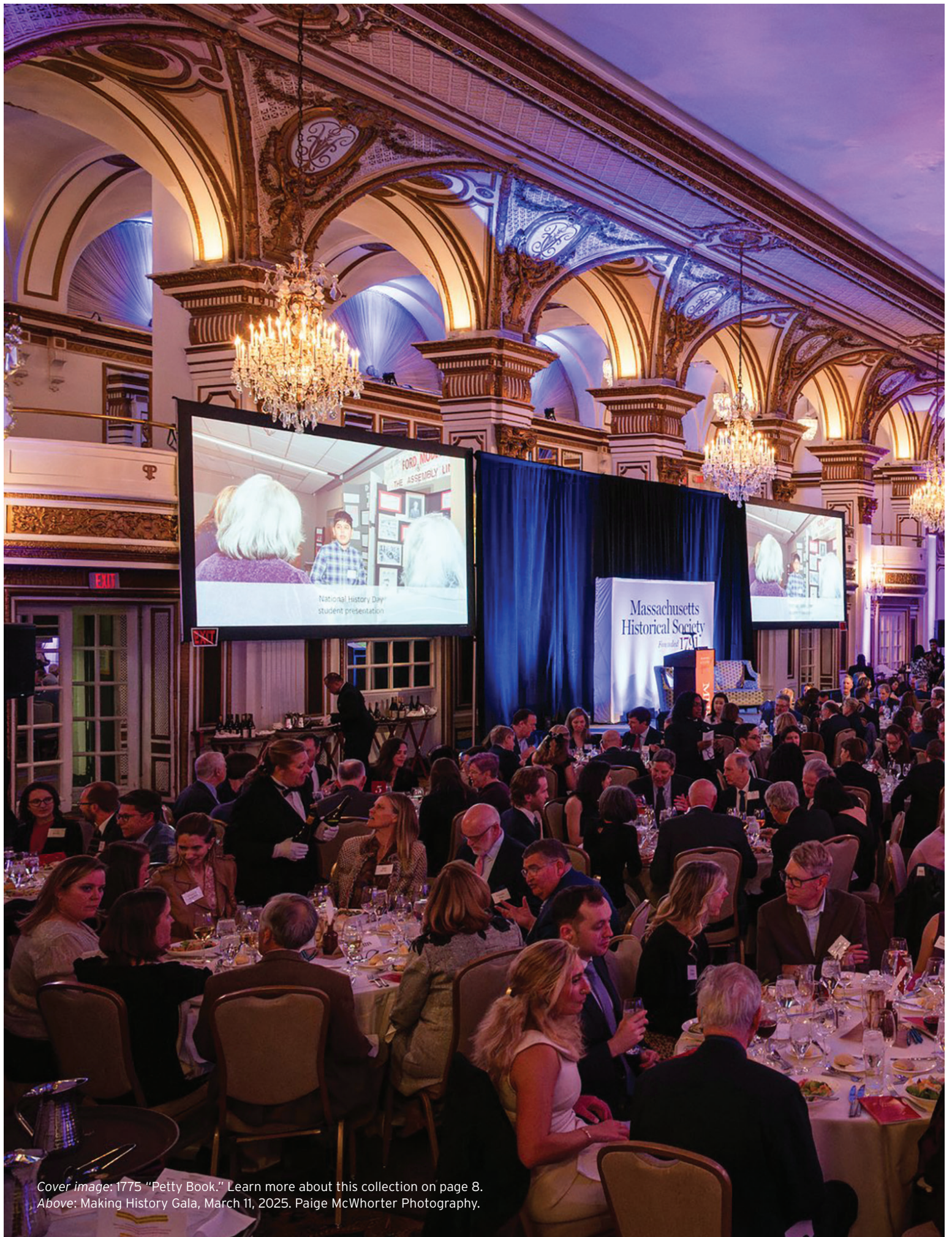
Cover image: 1775 "Petty Book." Learn more about this collection on page 8. Above: Making History Gala, March 11, 2025.